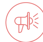
Image of the City